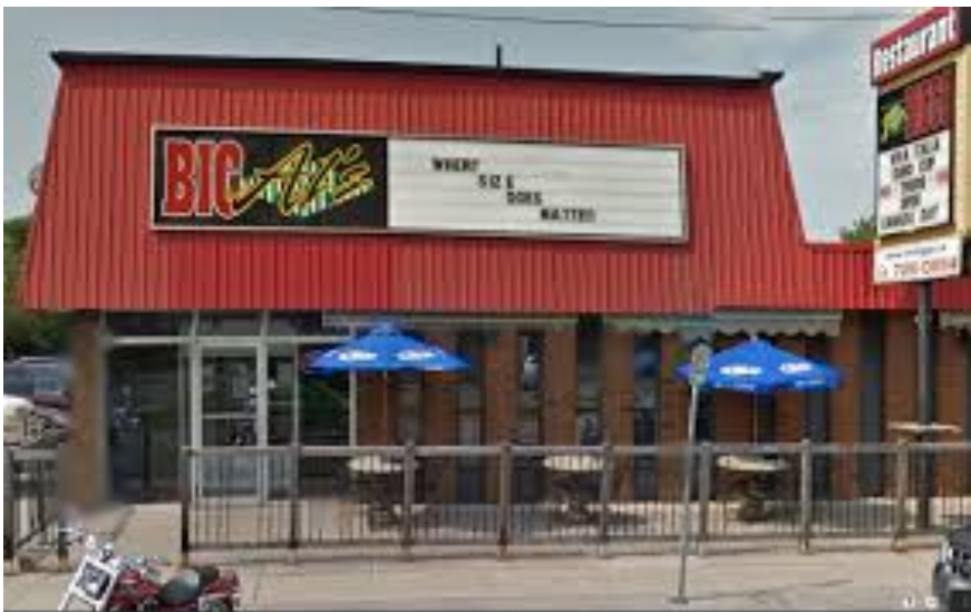
Mr Biggs ... 405 Notre Dame St, Belle River

We can review what the ontario exec has been up to, what we can do locally and enjoy a beer.